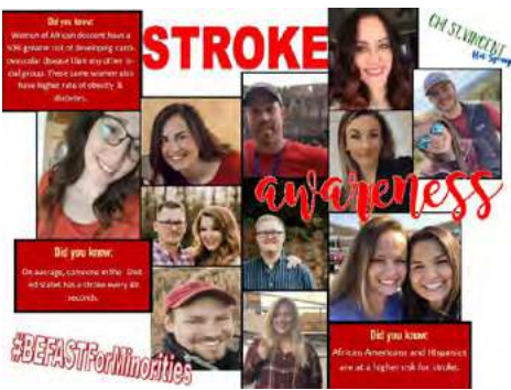
CHI St. Vincent-Hot Springs

Stroke Program Hospitals showed their support by creating heart collages with employees wearing red to educate their communities on stroke signs and symptoms, using the hashtag #BEFASTForMinorities . Thank you to everyone that took the time to create heart collages. Posting your collage on your hospital's social media accounts, your personal accounts and throughout your facility will increase awareness and educate those within your community on how to protect their hearts and brains.