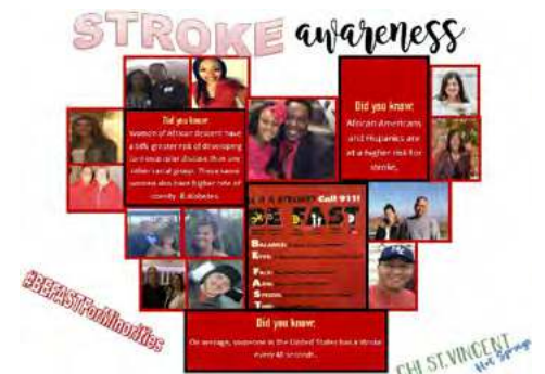
CHI St. Vincent-Hot Springs