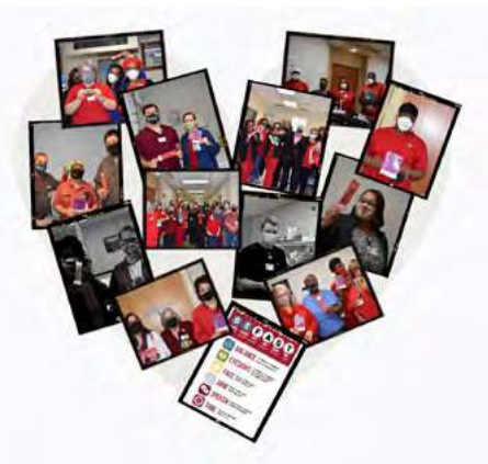
McGehee Desha Hospital