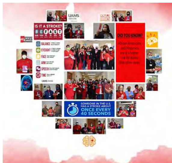
McGehee Desha Hospital