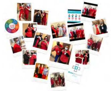
Drew Memorial Hospital