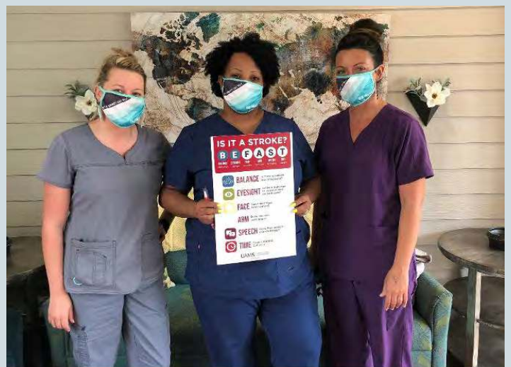
Baptist Hospital- Arkadelphia & Courtyard Gardens Health and Rehabilitation Center