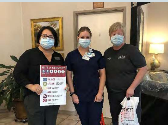
Baptist Hospital- Arkadelphia & Twin Rivers Health and Rehabilitation