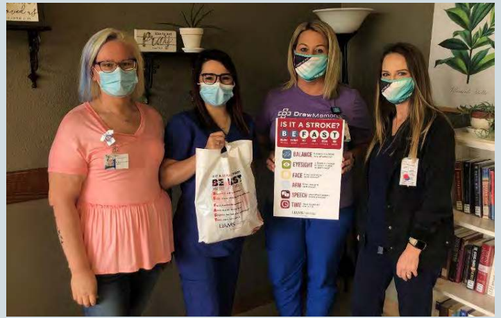
Drew Memorial Hospital & The Woods of Monticello and Rehabilitation Center