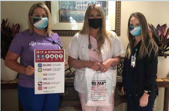
Drew Memorial Hospital & Belle View Estates Rehab and Care Center

Click here to view our Seniors and Stroke PSA.